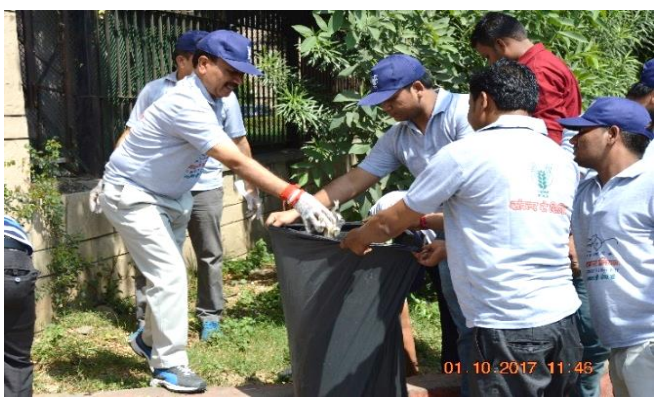
Swachhata Abhiyan near National Science Museum