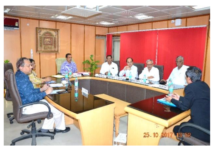
Interview Board in Progress

219 proposals were received under CAS from different institutes in 56 disciplines for promotion from senior scientists to the grade of principal scientists. The Interviews were conducted from 4 September, 2017 to 25 October, 2017.