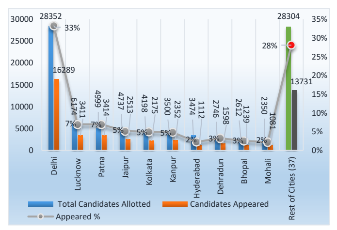
Centres wise details of candidates

examination. Details of candidates registered, appeared at different centres located in ten cities are as follows: