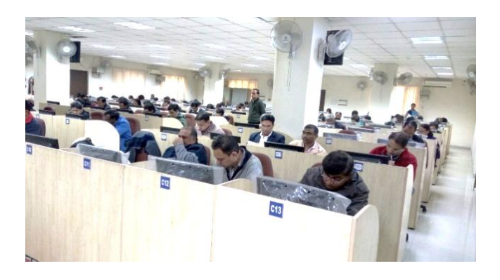
View of Limited Departmental Competitive Examination